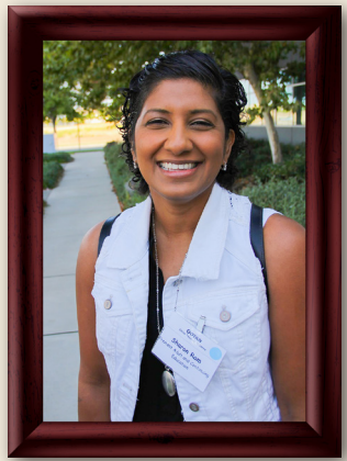
May 31, 1973 – September 2, 2017 Fremont Adult and Continuning Education Fremont, CA